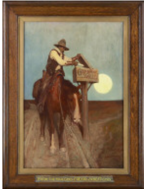
Rural Delivery (Where the Mail Goes, "Cream of Wheat" Goes) Newell Convers Wyeth 70.63